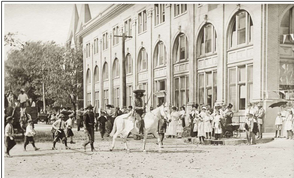
Corner of First and Tremont Near the Star Courier Building

Old photos of historic events are precious and add texture to any